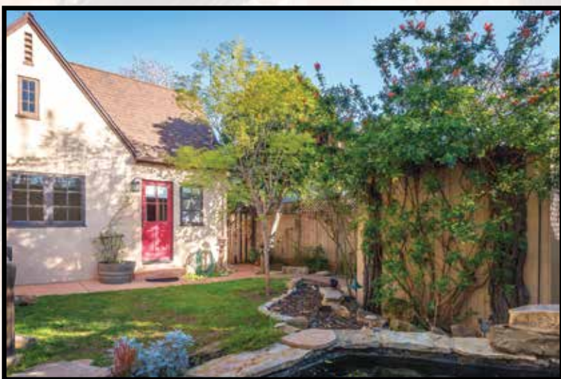
Tranquil backyard with pond

Beautiful and peaceful garden areas accent the ambience of the timeless style. A newer upstairs mountain-view 2nd master suite and family room provide space for today's living, for a total of 4 bedrooms, 3 baths in 2289 measured square feet.