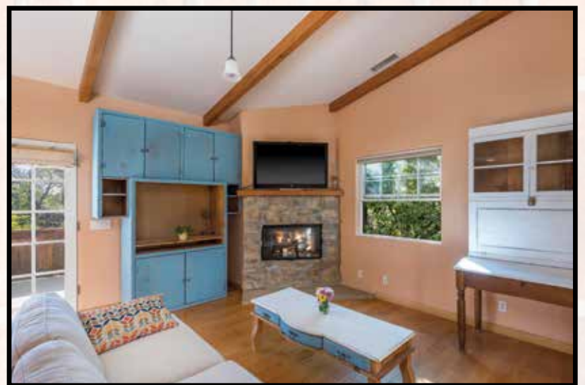
Upstairs family room addition