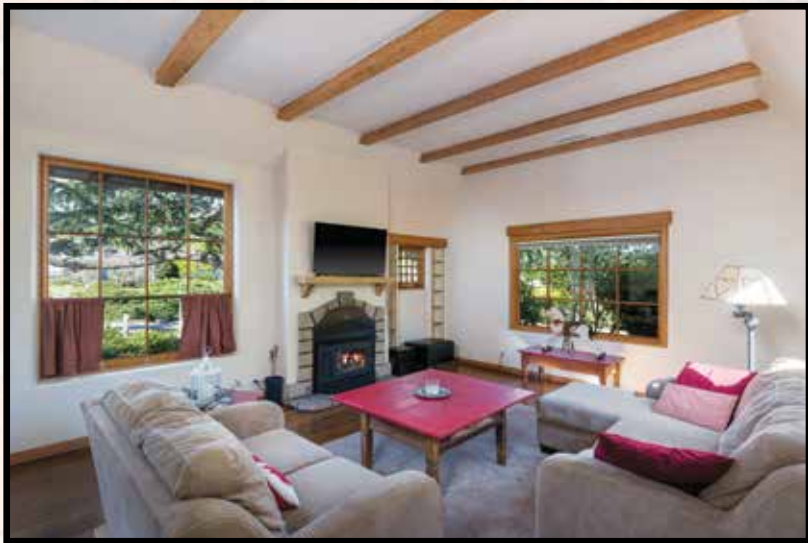
Living room with wood beams

For sale for the 1st time in 30 years, 3101 Calle Mariposa is one of old San Roque's most cherished corner properties. The home is an original Tudor-style built in 1929 with all the charm and potential that comes with a period architectural home in one of Santa Barbara's finest neighborhoods. The location is on the quiet upper side of the Argonne Circle area.