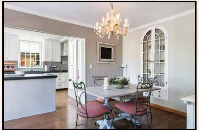
Formal original dining room with built-in

Beautiful and peaceful garden areas accent the ambience of the timeless style. A newer upstairs mountain-view 2nd master suite and family room provide space for today's living, for a total of 4 bedrooms, 3 baths in 2289 measured square feet.