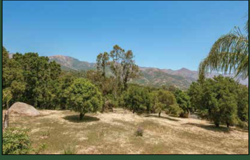
Ample yard space