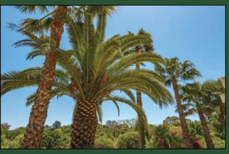
Mature palm trees